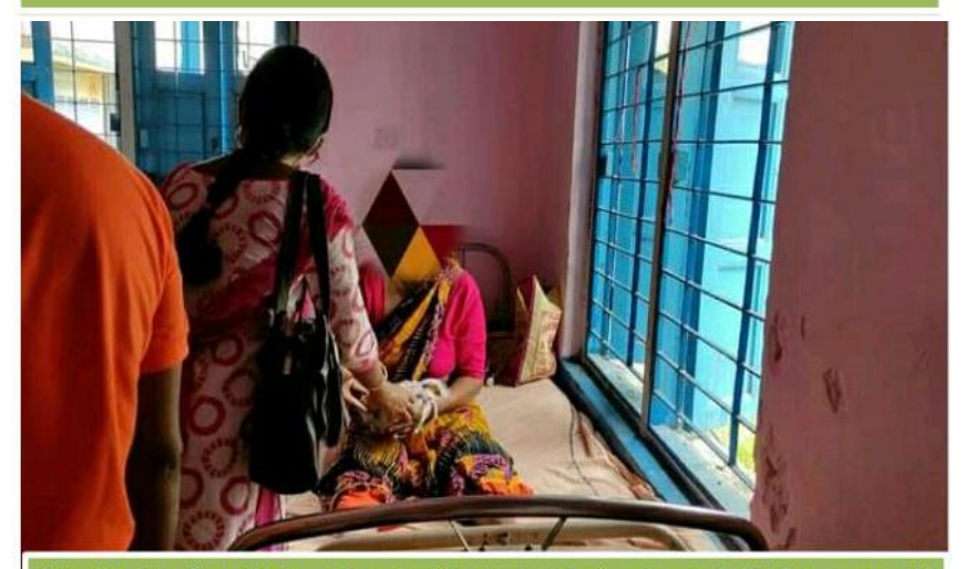
Distribution of medicine to 8 patient in pandemic situation by B.P.Ed semester IV , Department of physical education , Mugberia Gangadhar Mahavidyalaya, Bhupatinagar, Purba Medinipure, WB.