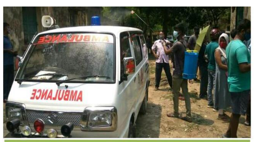
Distribution of medicine to 12 patient in pandemic situation by M.P.Ed semester IV, Department of physical education, Mugberia Gangadhar Mahavidyalaya, Bhupatinagar, Purba Medinipure, WB.