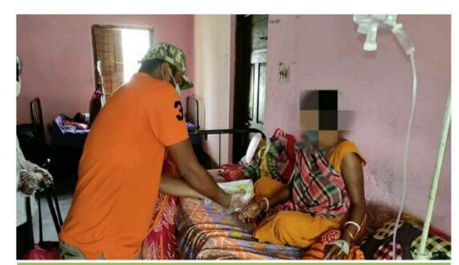
Distribution of medicine to 10 patients in pandemic situation by M.P.Ed sem II, Department of physical education. Mugberia Gangadhar Mahavidyalaya, Bhupatinagar, Purba Medinipur, WB.